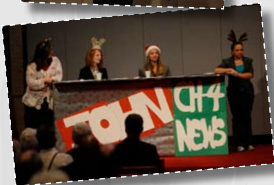
The youth broadcasted from the John Channel 4 news room during the Christmas program Dec. 13.